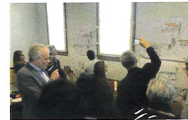
HUNDRED Plan Implementation Strategy Workshop.

Approved via resolution of the Las Vegas City Council in November 2020. Cross-departmental work to implement DEI is underway so that every aspect of work and interaction by the City ensures an equity component is executed in every effort.