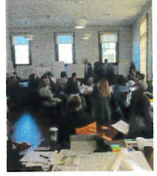
HUNDRED Plan Implementation Strategy Workshop.