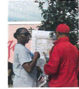
Love on Jackson Event.