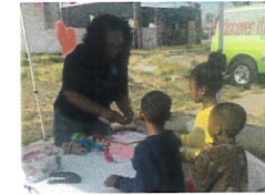
Love on Jackson Event.