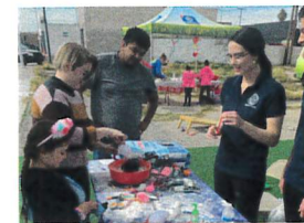
Love on Jackson Event.