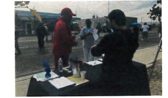
Love on Jackson Event.